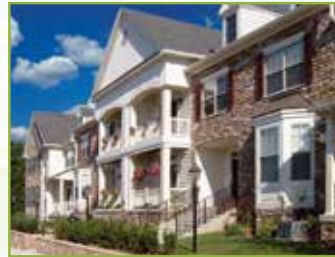
Heritage Greene 807 Ridgeview Court, Sellersville, PA 18960