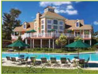
Heritage Orchard Hill - Clubhouse 1 Applewood Drive, Perkasie, PA 18944