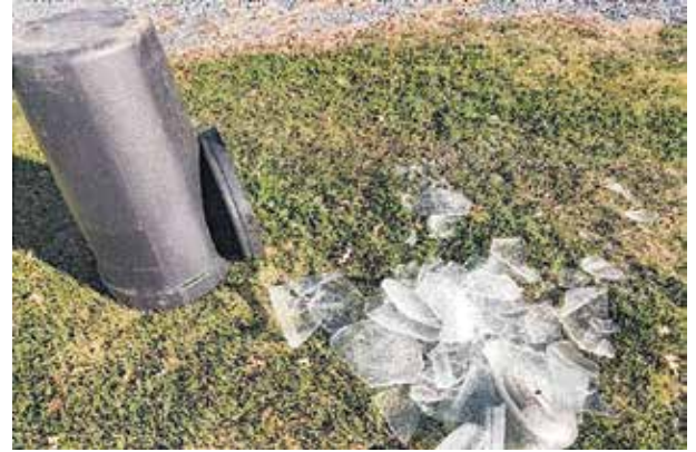
Empty and disconnect your rain barrel in the fall to avoid damage from freezing water.

A hard freeze is when the temperature dips below 28°F for an extended period. This cold weather is enough to turn a barrel of water into ice. Pennsylvania's typical first hard freeze date varies from early October in some northern counties to late November in the Philadelphia area. The typical last hard freeze date ranges from mid-March in southeastern Pennsylvania to early May in a few north-central counties. You can learn your area's first and last hard freeze dates by visiting the National Weather Service ( https://www.weather.gov/ )'s website and following the instruction included in this article.