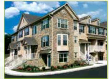
Heritage Pointe Village Way, Chalfont, PA 18914