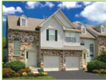
Heritage Summer Hill Signature Drive, Doylestown, PA 18902